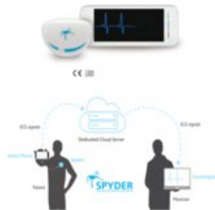
Cloud-based Wireless ECG Monitoring System - Spyder

WEB produces the Spyder ECG , the World's first medical grade ECG wearable that transmits continuously through a smartphone to a Cloud Database. Artificial Intelligence (AI) is then applied to the data to analyze ECG rhythm abnormalities in real-time. Its unique 24/7 "always on" system allows continuous patient ECG data transmission from anywhere in the world with a connected smartphone. Physicians can remotely log in securely into the database and report findings to patients from another connected device.